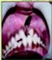
SECONDARY ALVEOLAR BONE GRAFTING