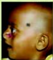
NASAL CLEFT REPAIR