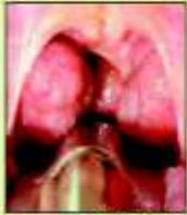
SECONDARY CLEFT PALATE REPAIR