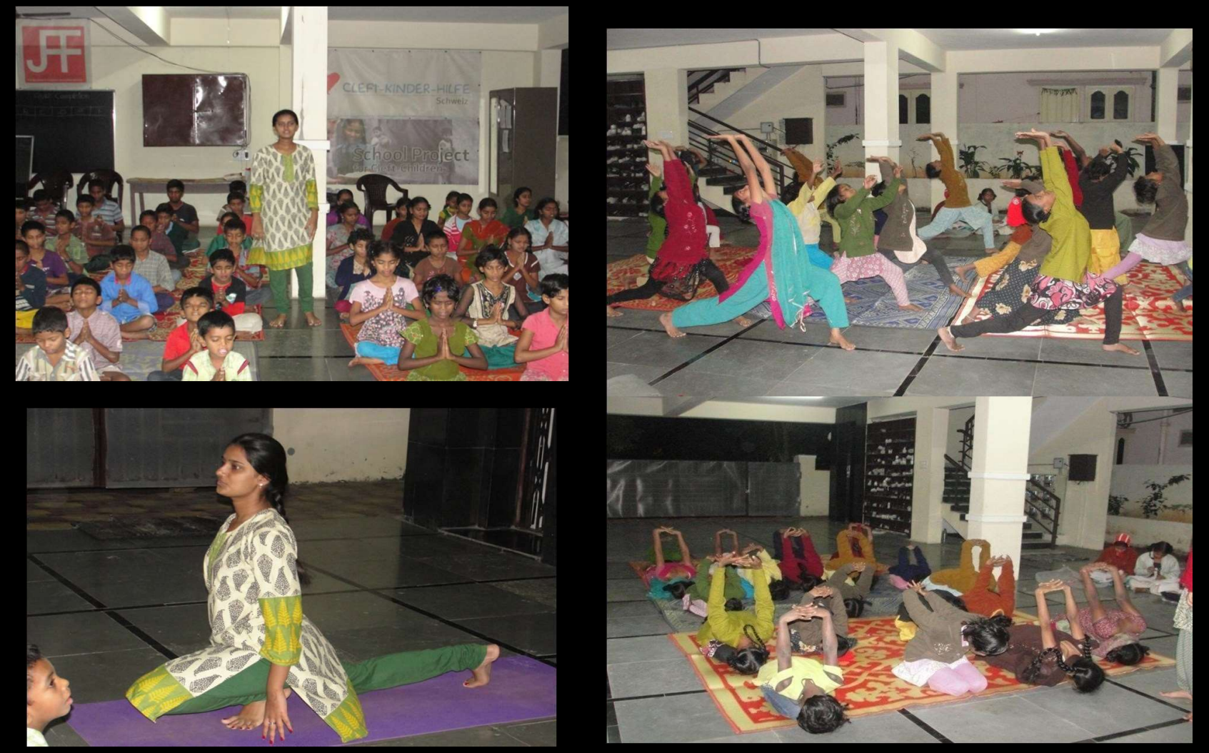
Hyderabad Cleft Society