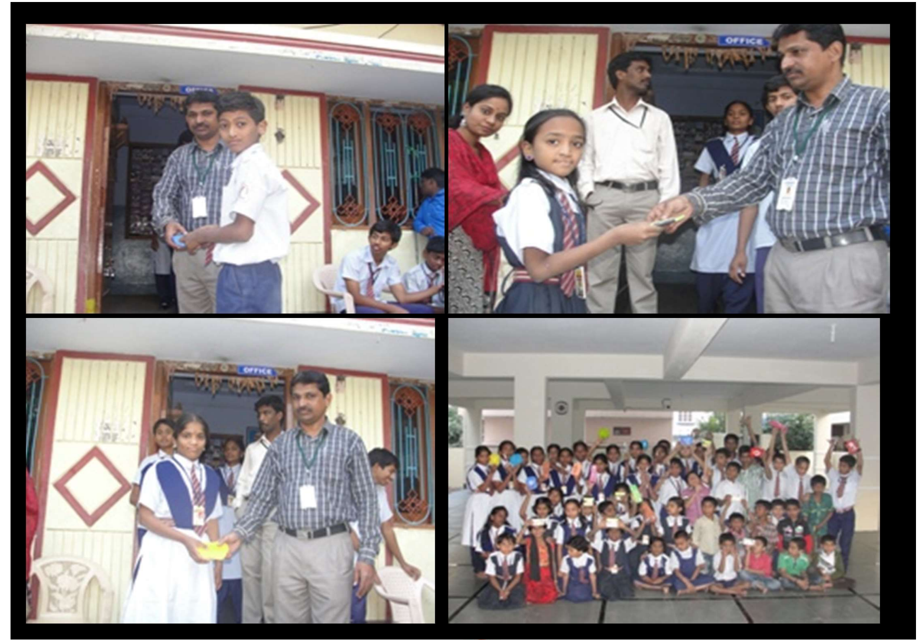
Hyderabad Cleft Society