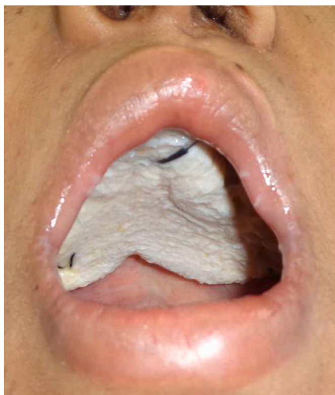
Figure 3. Oral antibiotic pack over palatal fistula

group B (no oral pack) was higher than in group A (with oral pack) though the difference was statistically not significant (OR = 2.80, CI = 0.48...16.3, p = 0.242 ) (Table 1). In group A (with oral pack) 6.66% ( n = 2 ) had a fistula 6 months after fistula repair, while 16.66% ( n = 5 ) of the patients in group B (without oral pack) showed a re-occurrence of the fistula.