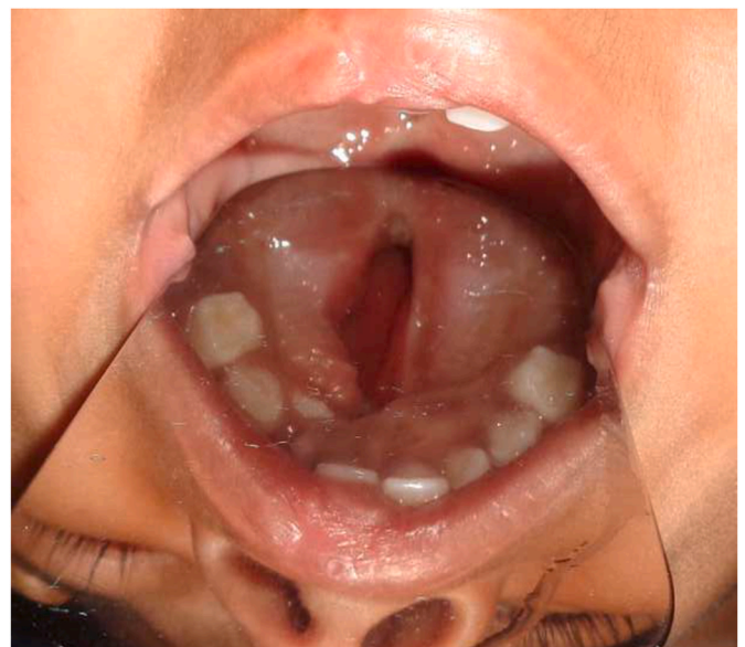
Figure 1. Pre operative picture of Palatal Fistula

Six months after fistula repair the rate of fistula re-occurrence in