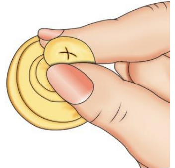
CROSS CUT NIPPLE