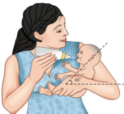
CORRECT POSITION OF FEEDING