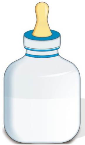
MEAD JOHNSON NURSER BOTTLE