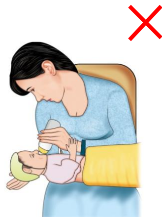
INCORRECT POSITION OF FEEDING